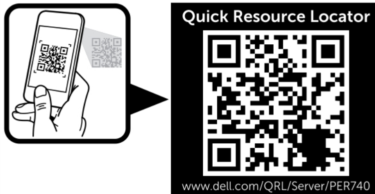
Figure 2. Quick Resource Locator for PowerEdge R740 and R740xd systems