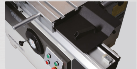
Ball bearing sliding along tempered and ground prismatic guides guarantees smooth and precision sliding cutting.