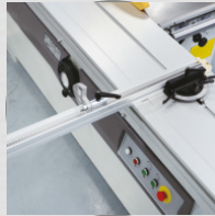
Angled cutting device