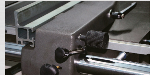
Solid cast iron rip fence with aluminium profile mounted to 50mm bar, for accurate reliable ripping.