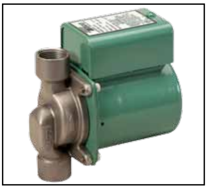
Stainless Steel Model