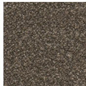
MOCHA HOLLAND AND SHERRY