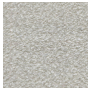
IVORY HOLLAND AND SHERRY