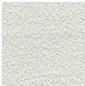
SNOW HOLLAND AND SHERRY