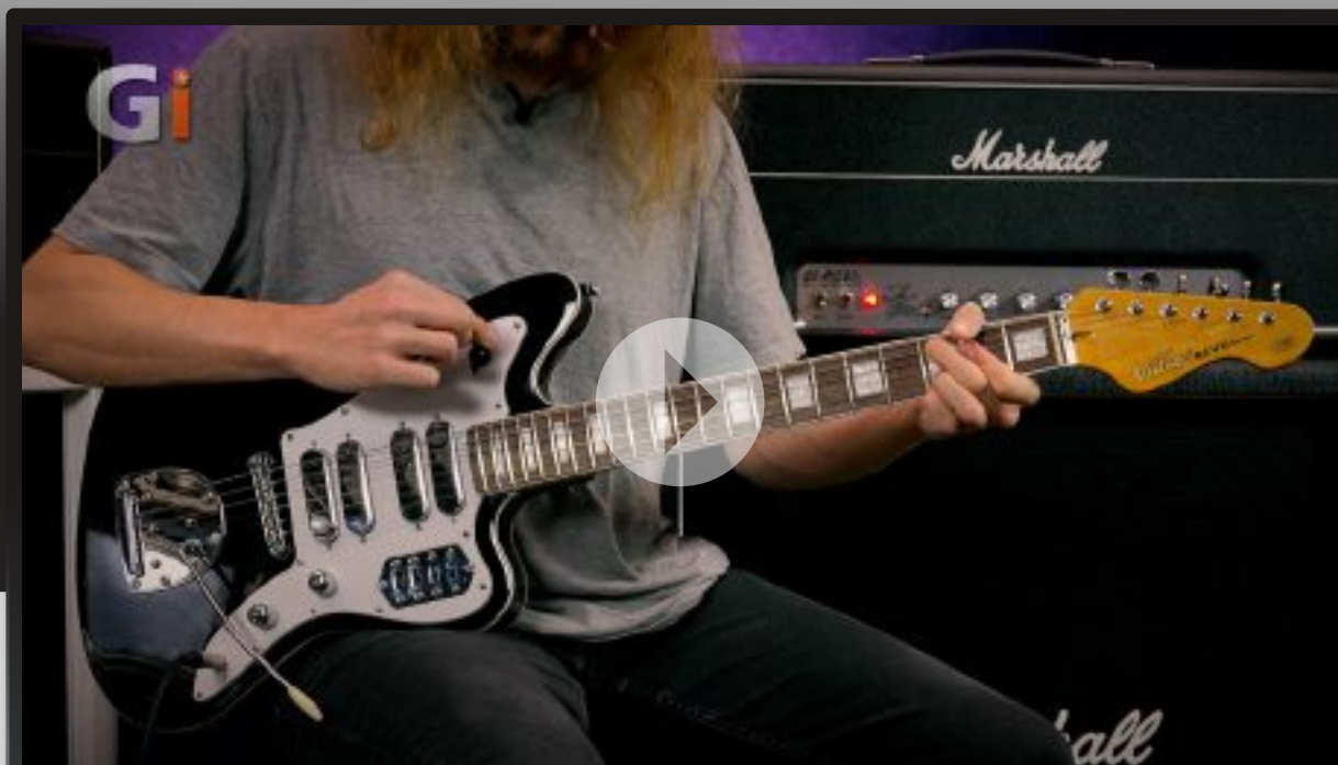
Vintage Revo Series Surfmaster Quad Guitar – Black