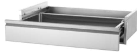
RO-ACC-WDT-2418 Drawer 28" Wide for Worktable 24" Deep, Inside Pan 24" X 18"