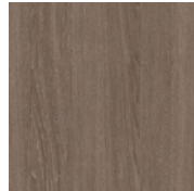
TAUPE BRUSHED OAK