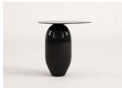
BLACK MIRROR LACQUER