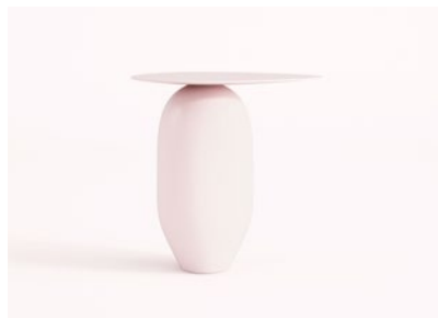
PINK MATTE LACQUER