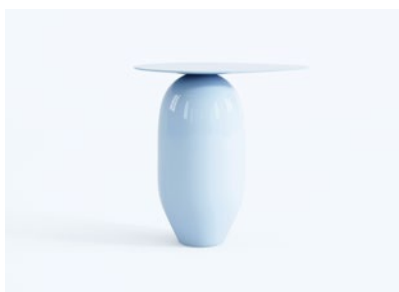
BLUE MIRROR LACQUER