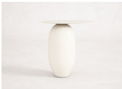
CREAM MATTE LACQUER