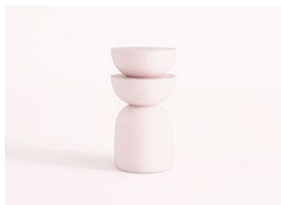
PINK MATTE LACQUER