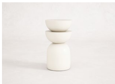
CREAM MATTE LACQUER