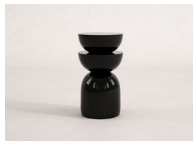
BLACK MIRROR LACQUER