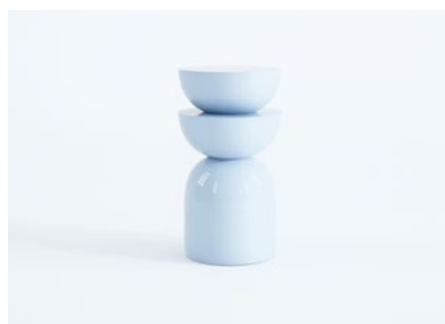
BLUE MIRROR LACQUER