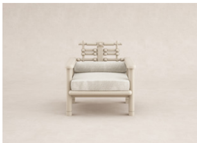
BLEACHED ASH & LOUISON WOOD AND FABRIC BY PIERRE FREY