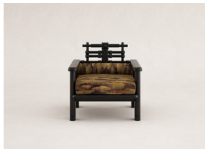
BLACK OAK & OBERNAI TOURBE WOOD AND FABRIC BY PIERRE FREY