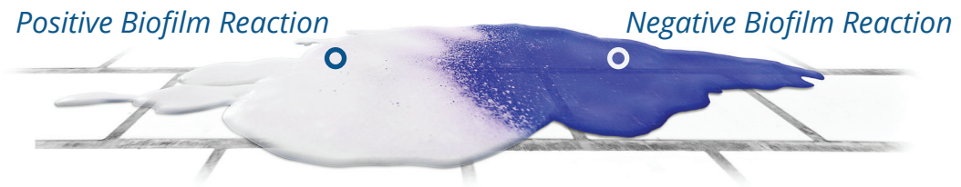
Negative Biofilm Reaction