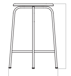
Ø: 48 cm / 18,9"

Please visit menuspace.com for materials, care and maintenance instructions.