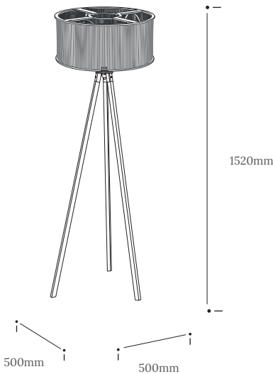
Cage Floor Light Birch/Ash - £745

Steam bent ash spirals somersault within a fine dowel cage. Playing with perspective, our Cage Lighting Range sees freedom and constraint collide — with dramatic impact. A riot of energy by day, a shower of shadows by night. On or off, the Cage's interplay of textures, movement and light invites a closer look. Corkscrewing behind a delicate yet rigid birch surround, it epitomises the spirit of nature — commanding and wild in perfect measure. Use the Cage Floor Light to illuminate specific areas, to layer light and create ambience in your space. Add drama. Add depth. See differently. The Cage Lighting Range is also available as a standard and large pendant light.