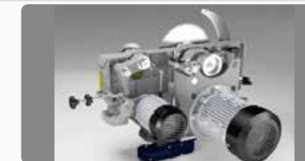
One-piece cast iron movement with 30mm diameter linear guides for increased load bearing, impact resistance, maintenance free and longer life