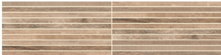
Amber Blend 2x48 Range