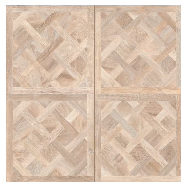
Blonde Decor 32x32 Range