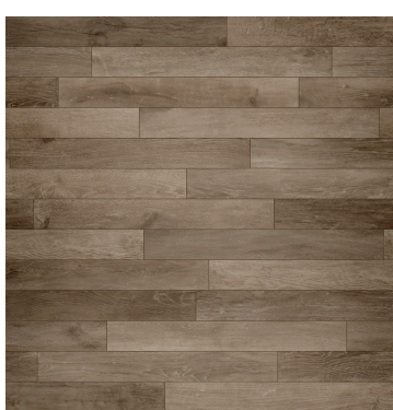
Greige 6x48 Range