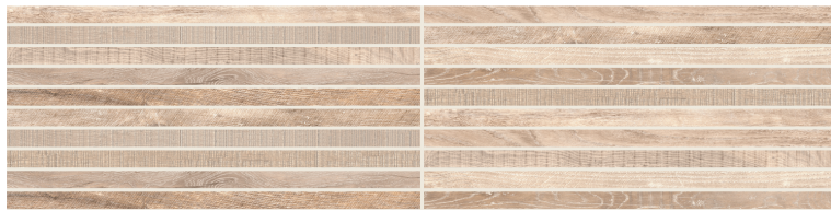
Blonde Blend 2x48 Range