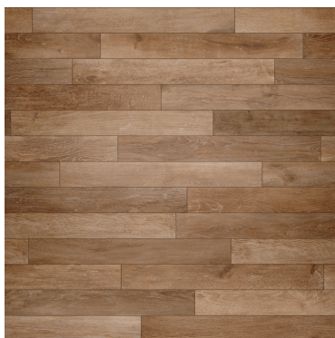
Amber 6x48 Range