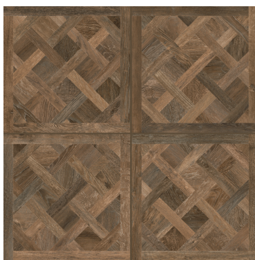
Chestnut Decor 32x32 Range