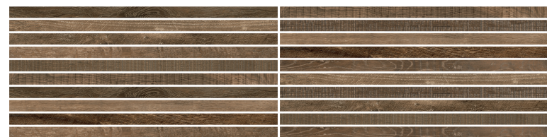
Chestnut Blend 2x48 Range