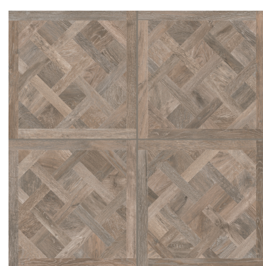
Greige Decor 32x32 Range