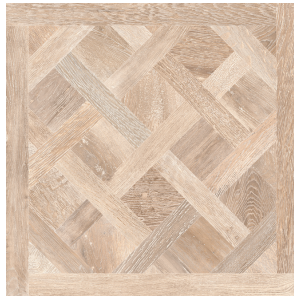
Blonde Decor 32x32