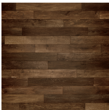
Chestnut 6x48 Range