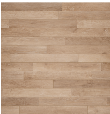
Blonde 6x48 Range