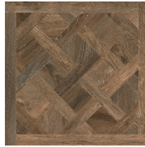
Chestnut Decor 32x32