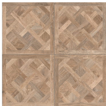
Amber Decor 32x32 Range