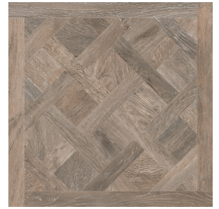
Greige Decor 32x32