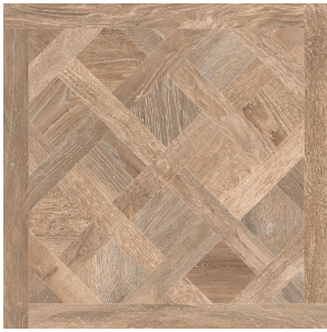
Amber Decor 32x32