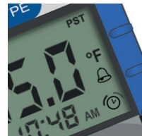
Count-down timer and alarms