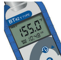
Max/Min feature recalls highest and lowest reading