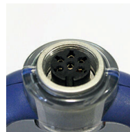
Secure Lumberg Connector