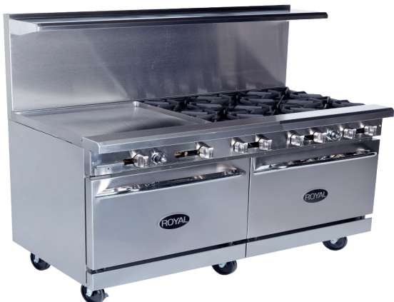
RR-6G24 with optional casters

Models: RR-10 RR-8G12 RR-6G24 RR-4G36 RR-2G48 RR-G60 RR-6RG24 RR-8GT12 RR-6GT24 RR-4GT36 RR-2GT48 RR-GT60