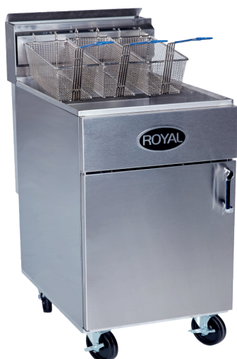
RFT-60 with optional casters