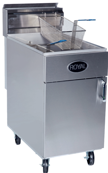
RFT-75 with optional casters