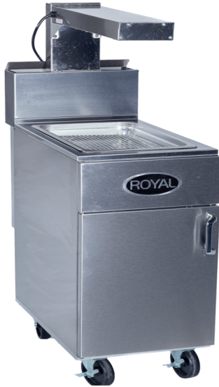
RFT-DS shown with optional heat lamp and optional casters