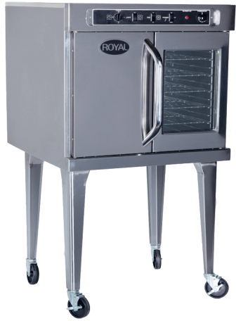
RECO-1 with optional casters

Models: RECO-1 RECO-2 RECO-6K-1 RECO-6K-2