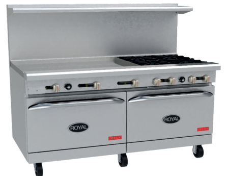
RDR-6G24 with optional casters