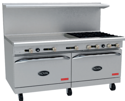
RDR-6G24 with optional casters

Models: RDR-10 RDR-8G12 RDR-6G24 RDR-4G36 RDR-2G48 RDR-G60 RDR-6RG24 RDR-8GT12 RDR-6GT24 RDR-4GT36 RDR-2GT48 RDR-GT60