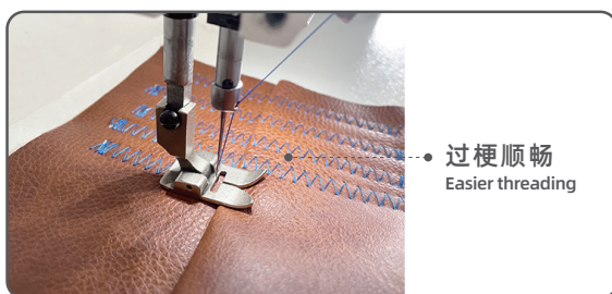
● 过梗顺畅 Easier threading