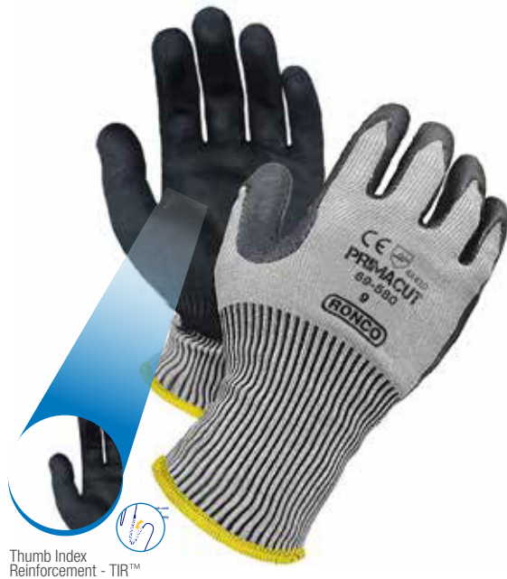
Thumb Index Reinforcement - TIR™