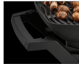
Side Handles for Easy Carrying