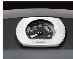
ACCU-PROBE™ Temperature Gauge