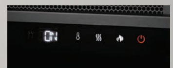
TOUCH CONTROL PANEL