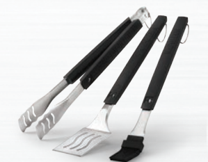
THREE PIECE TOOLSET #70054

Enclosed Cart Design Securely holds the propane tank within the cabinet for easy positioning and safe mobility.