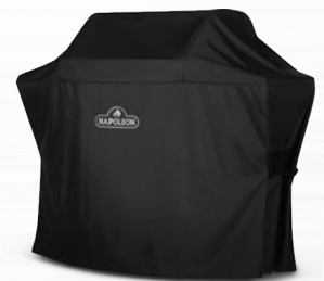
PREMIUM FITTED COVER #61444

Durable Cast Aluminum Fire Box Virtually indestructible, the fire box resists rust on a superior level and is backed by a 10 Year Warranty.