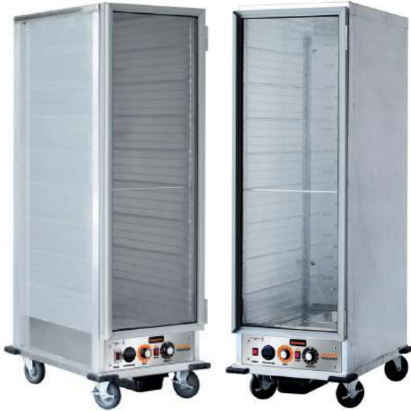
MODEL SHPN (NON-INSULATED)