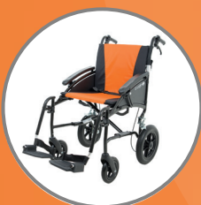
Transit version available