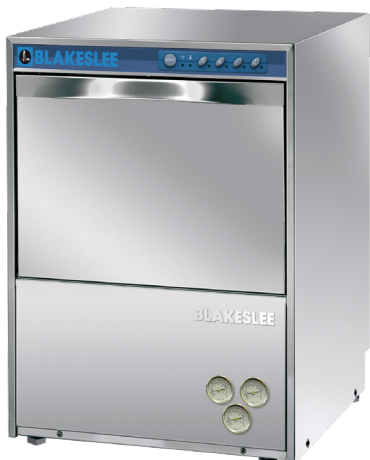
UC-18-1 / UC-18-3