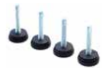
ONE FOOT PAD ITEM #4144