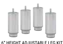
6" HEIGHT ADJUSTABLE LEG KIT