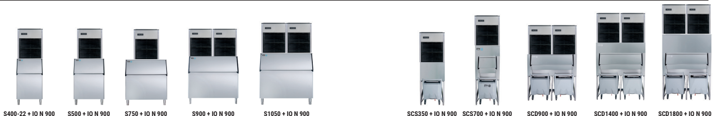
S400-22 + IQ N 900