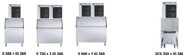
S 500 + IQ 300 S 750 + 2 IQ 300 S 900 + 2 IQ 300 SCS 350 + IQ 300