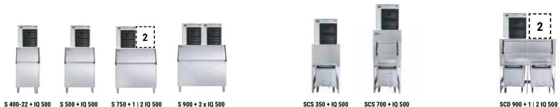
S 400-22 + IQ 500