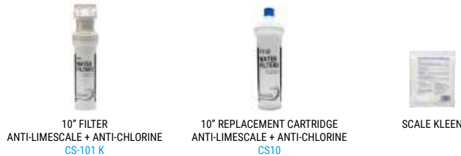
10" FILTER ANTI-LIMESCALE + ANTI-CHLORINE CS-101 K