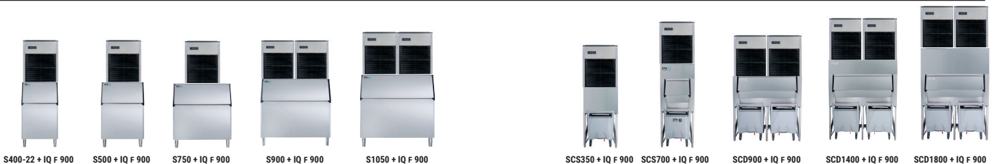
S400-22 + IQ F 900