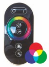
RGB LED lighting [option]