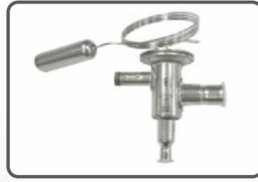
Expansion valve AGB models and AN model freezers