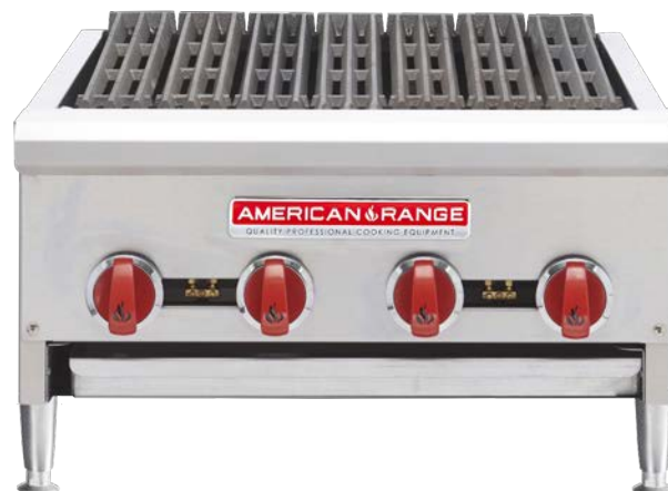
Model Shown ARRB-24