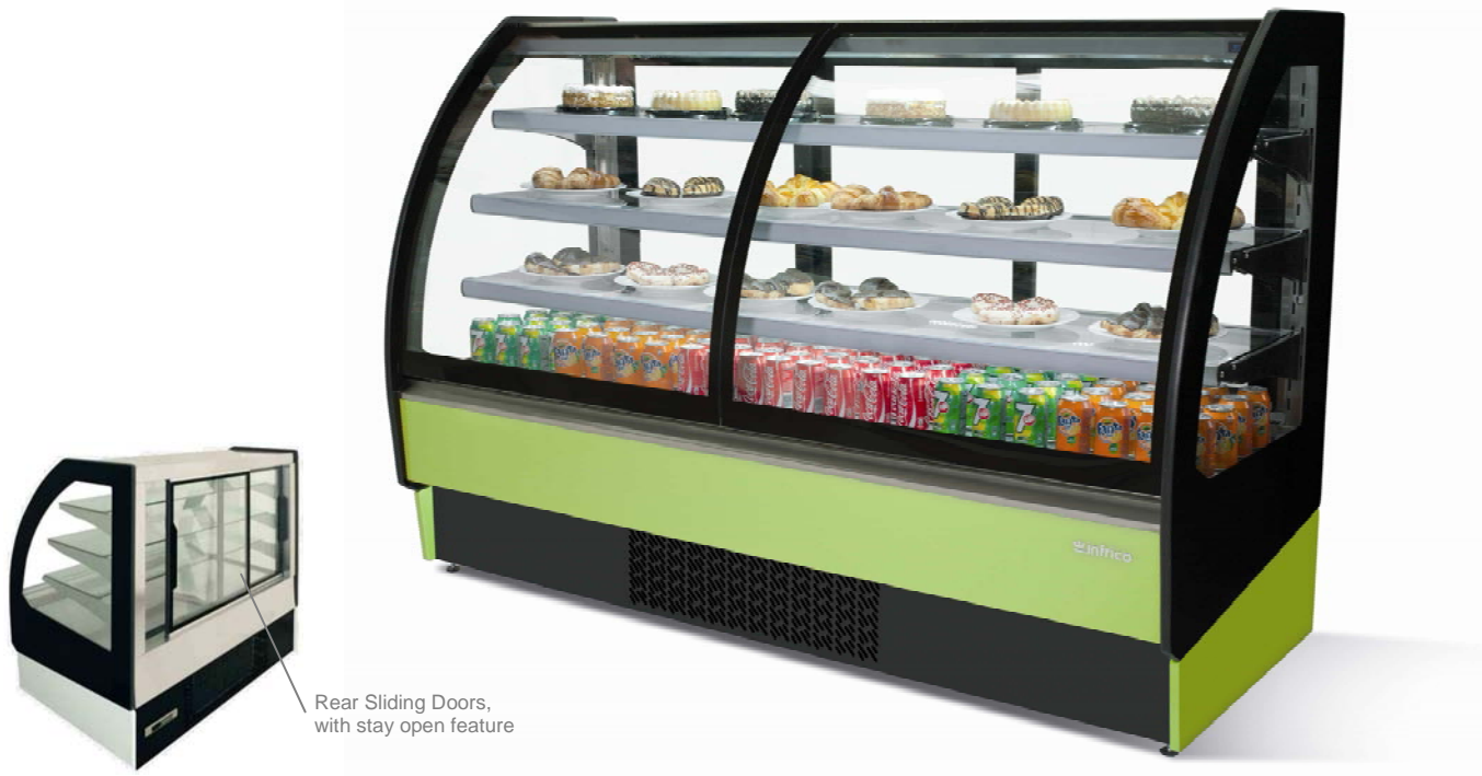
Rear Sliding Doors, with stay open feature