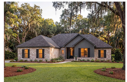
Alternate Color Scheme