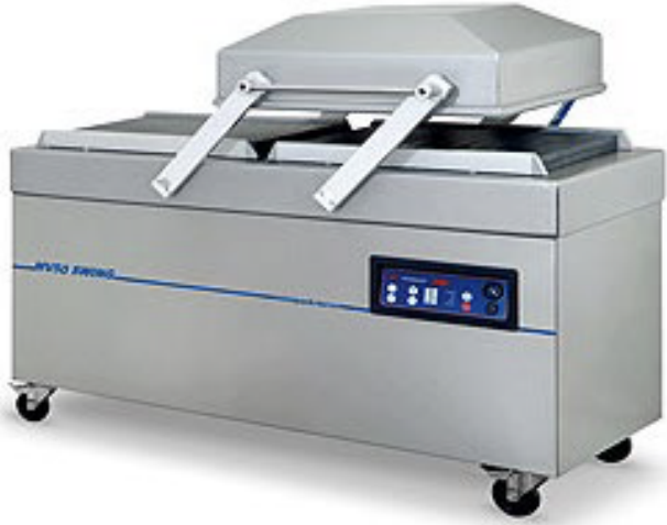
Front & Back: