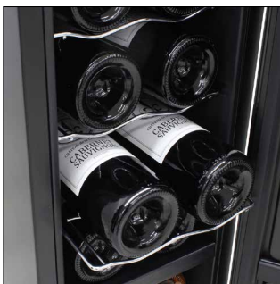
Shelves with Bottles