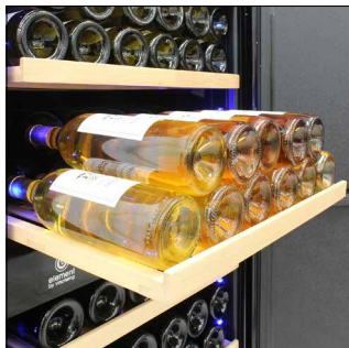
Racking with Bottles