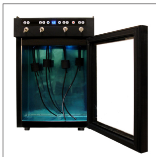
Opened Empty Unit