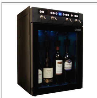
Wine Dispenser (Filled)