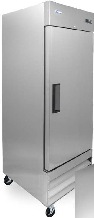
29" wide 59023 | FR-CN-0737E-HC