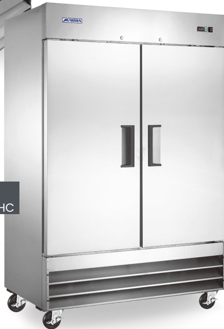
54" wide 59025 | FR-CN-1372E-HC