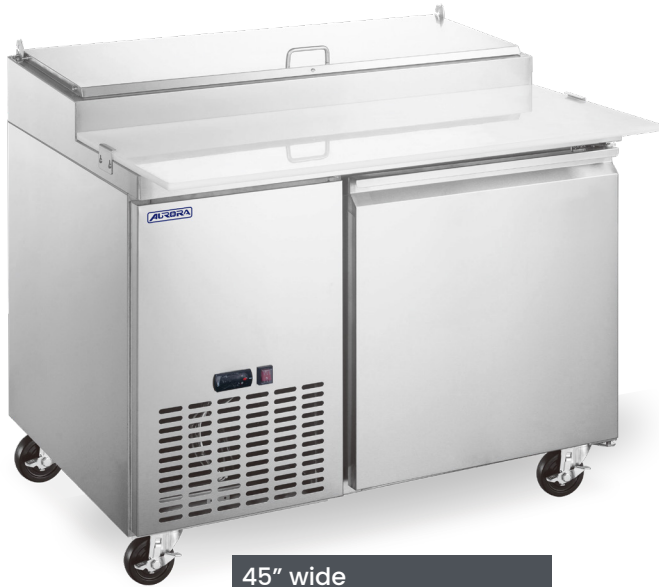
45" wide 59042 | PT-CN-1270E-HC

ITEM: 59042 59043 MODEL: PT-CN-1270E-HC PT-CN-1829E-HC