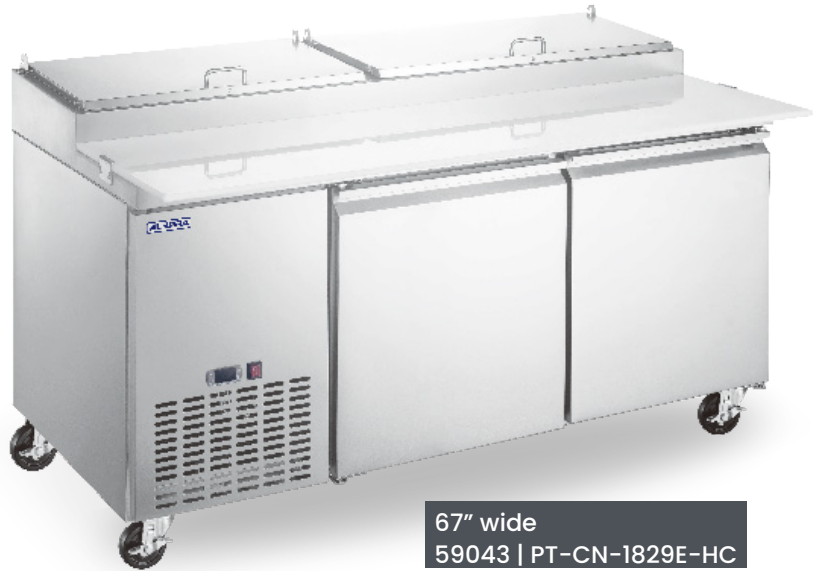
67" wide 59043 | PT-CN-1829E-HC

Aurora Refrigerated Pizza Prep Table helps you create your signature pizzas, sandwiches and salads quickly and easily.