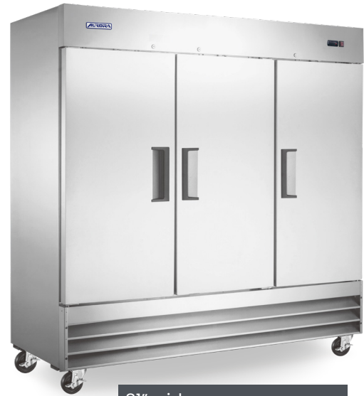
81" wide 59028 | RE-CN-0067E-HC