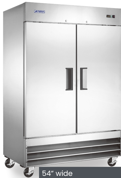
54" wide 59026 | FR-CN-1372E-HC