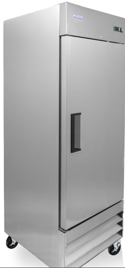
29" wide 59024 | FR-CN-0737E-HC