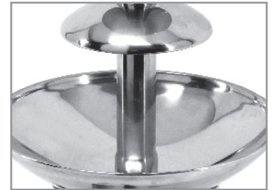
Polished stainless steel