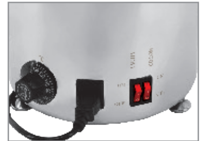
Temperature and Motor control