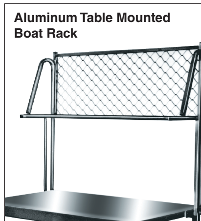
Aluminum Table Mounted Boat Rack