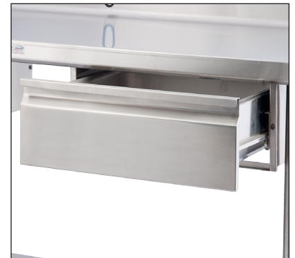
Roller Bearing Slide Draw SD-3RB / 24