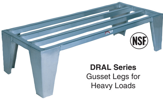
DRAL Series Gusset Legs for Heavy Loads